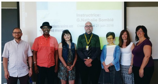
Workshop on mental health first aid for adults

In 2015-2016, Santé en français delivered two projects to improve access to mental health services: training in "Mental Health First Aid" and the mapping of mental health services available in French.